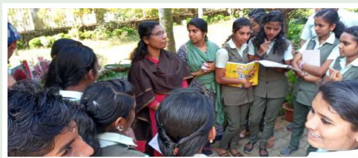
On The Job Training (OJT) at AMPRS, Odakkali

In partnership with the Directorate of Vocational Higher Secondary Education, Thiruvananthapuram, "On the Job Training programmes" for the VHSE students of 50 schools for 4 days with