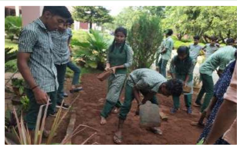
On The Job Training (OJT), COA, Padannakkad

30 students in each batch on “Gardner” and “Flori-culturist (Open Culti-vation)” were organi-zed through 20 exte-nsion/research centers under Kerala Agricultural University throughout the state.