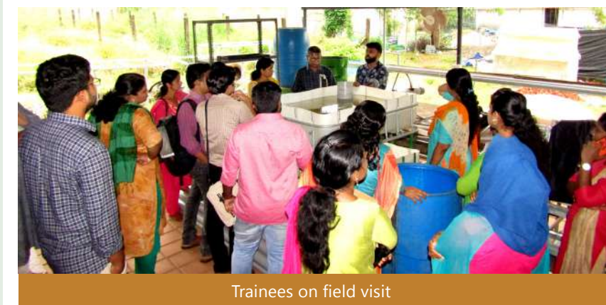
Trainees on field visit